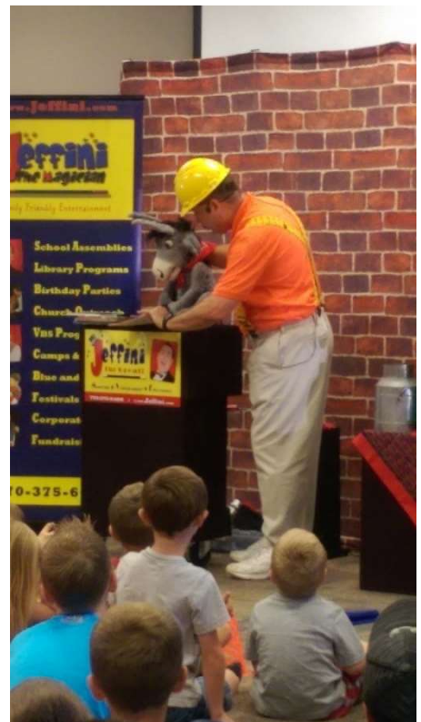
The Great Jeffini's Master Builder Program entertain a full house.