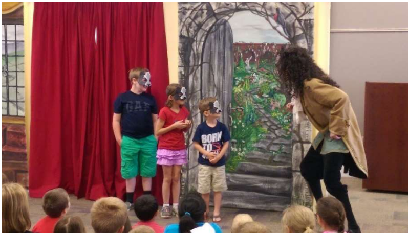
Hampstead Stage Company presents Beauty and the Beast